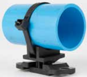
Surface mount bracket